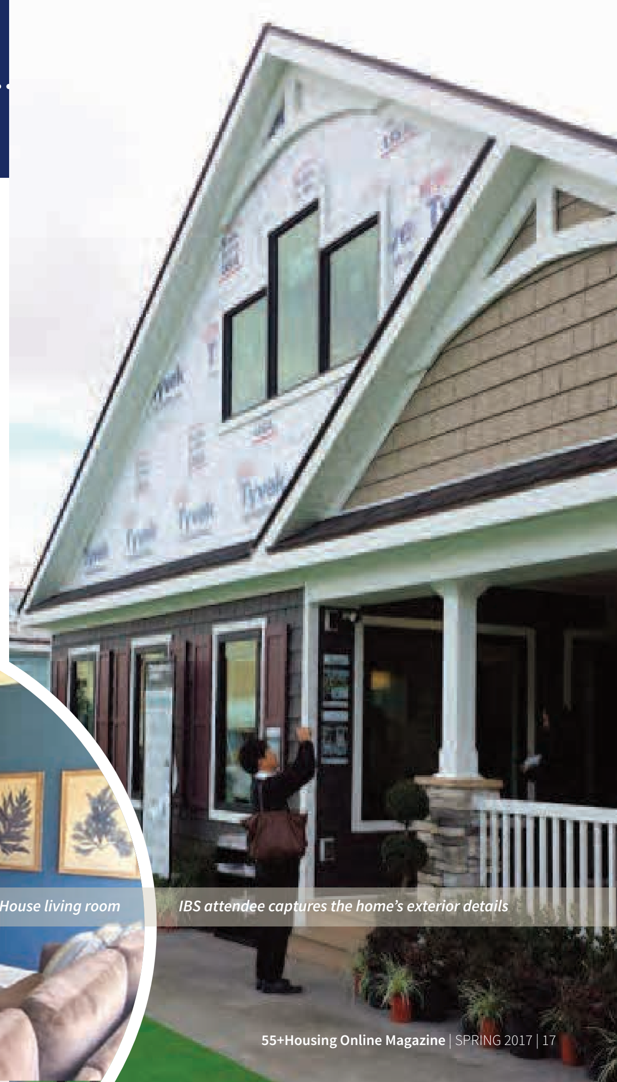
IBS attendee captures the home's exterior details