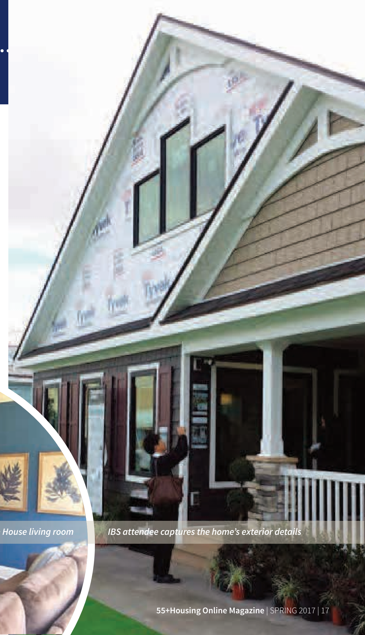
IBS attendee captures the home's exterior details